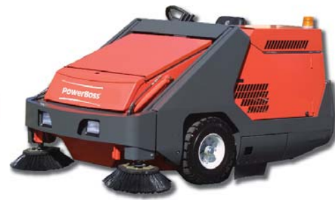
Armadillo 9XR 17,168sq.m. per hr 158cm Sweeping Path 623 Ltr High-Dump Hopper Gasoline, Diesel or LP Powered