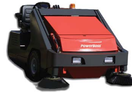
Armadillo 10X 20,234 sq.m. per hr 183cm Sweeping Path 850 Ltr High-Dump Hopper Gasoline, Diesel or LP Powered