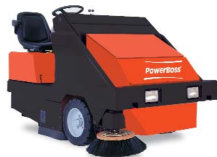
Armadillo 6X 11,520 sqm per hr. 134cm Sweeping Path 283 Ltr High-Dump Hopper Battery, Gasoline, Diesel or LP Powered