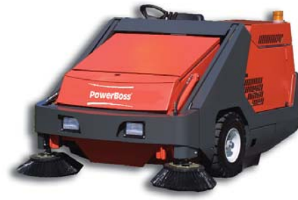
Armadillo 9XV 17,168 sq.m. per hr 158cm Sweeping Path 623 ltr High-Dump Hopper Gasoline, Diesel or LP Powered